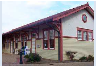
Your point of origin on this Quest Shares Front Royal history most exciting and best. Friendly folks at the Visitor's Center create for you a tour To imagine growth in the Shenandoah during the Civil War.