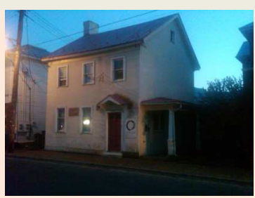
Up Chester street, close by the way, Reverend Trout, back in the day Lived with his lovely daughters three Colonial-revival style you see.

Four storefronts are still unified by heavily accented shop windows, recessed entrances, a bracketed cornice atop the shop windows, & a series of second story windows that are adorned by Italianate-style, semi-arched hoods & decorative window frames.