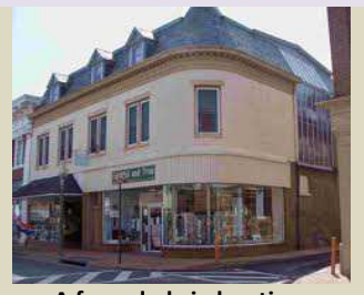
A fancy lady in her time A Victorian charmer in the prime With towers, dormers and fancy roof A new style was born and here is the proof.

A more elaborate "survivor" of the era, the Trout Drugstore Building incorporates fashionable elements of Victorian, including the corner tower, the mansard-type roof (a steeply-pitched, hat-like roofline), & roof shingles laid in an elaborate pattern. The builder also availed himself of the Colonial or Classical Revival in the pedimented dormers, trademarks of that "new" style of architecture.