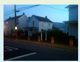
Cross the intersection plus one abode Built a big one to rent with dollars earned, seeds she sowed.

Whether Italianate or Georgian, among its many amenities are 7 fireplaces, 3 of which are marble; the most ornate being in the dining room with carvings of birds, cherubs, flowers, and ladies. Ann and Bill Wilson were first to use this beautiful home as a B&B.