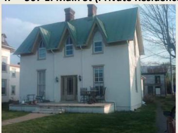
Just next door, don't overlook The onetime home of Doctor Cook If Gothic is the look you love, Two chimneys, matched, the roof above