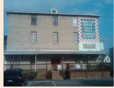
Every little village needs A mill to buy your cattle feeds Ours evolved into a place Where folks just love to feed their face!

The picturesque Train Station was refurbished during the 1980's as a result of the Downtown Revitalization Project. Bright yellow clapboards, orange trim and a terra cotta tiled roof recreate the appearance of an earlier period.