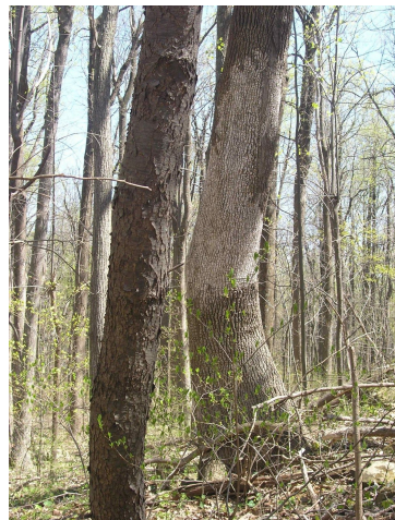
Black cherry on left, yellow poplar (also known as tulip tree) on right.

In 32 or so more steps, Two trees you’ll find, again, on left. Their bark allows you to ID Even when there ain’t no leaves.